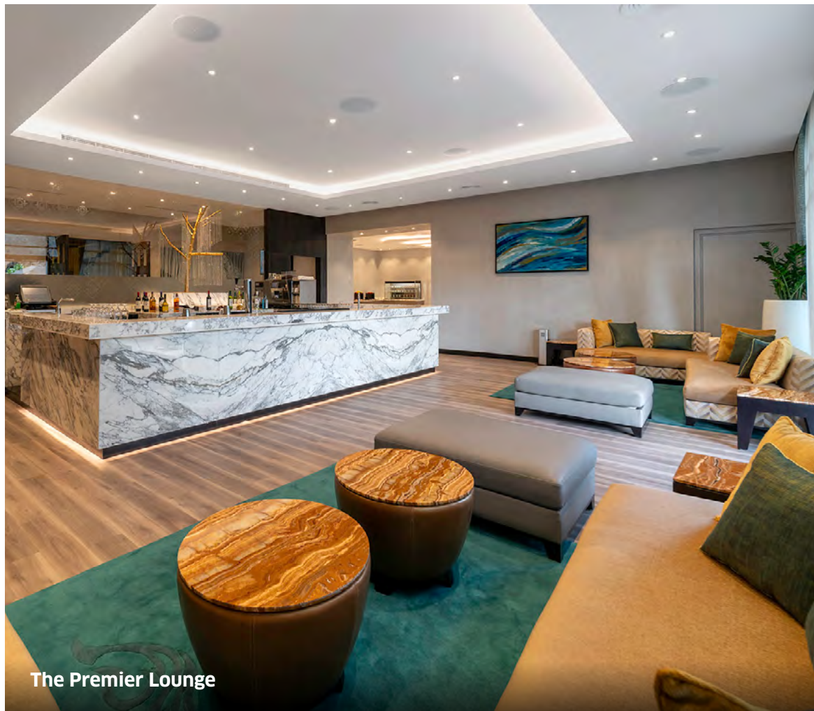
The Premier Lounge