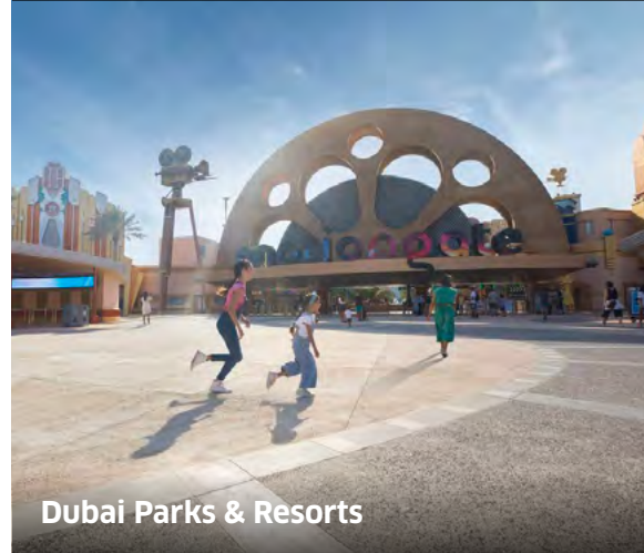
Dubai Parks & Resorts