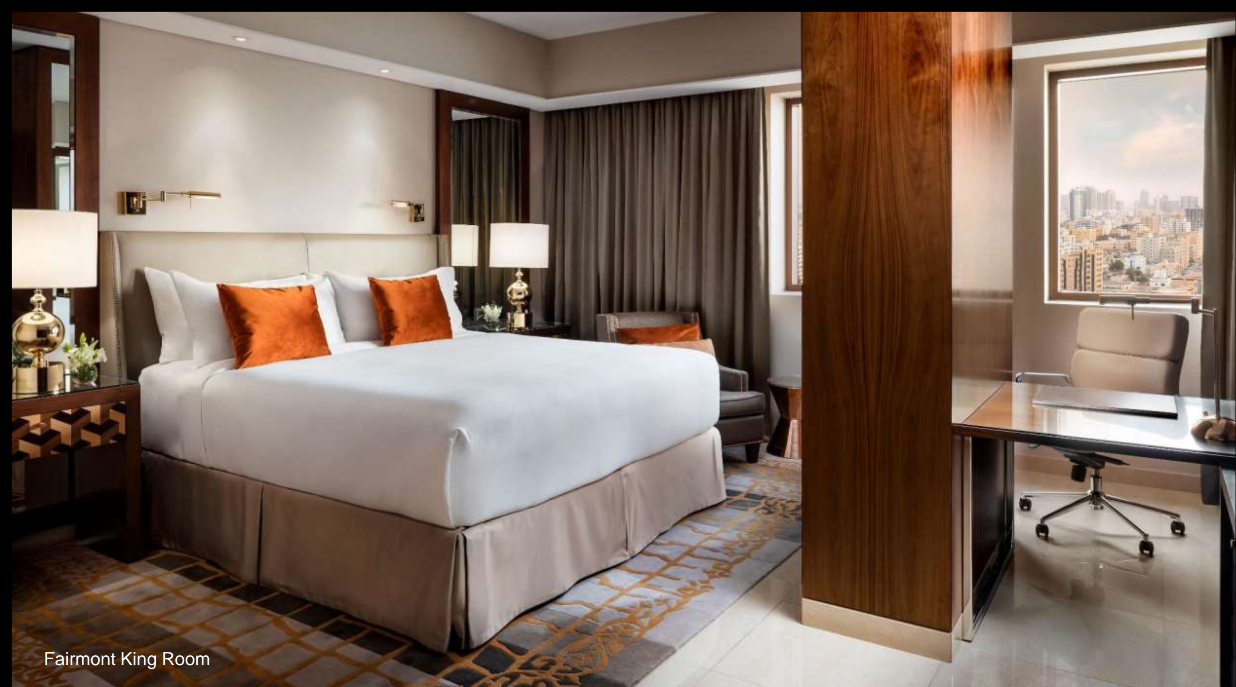
Fairmont King Room