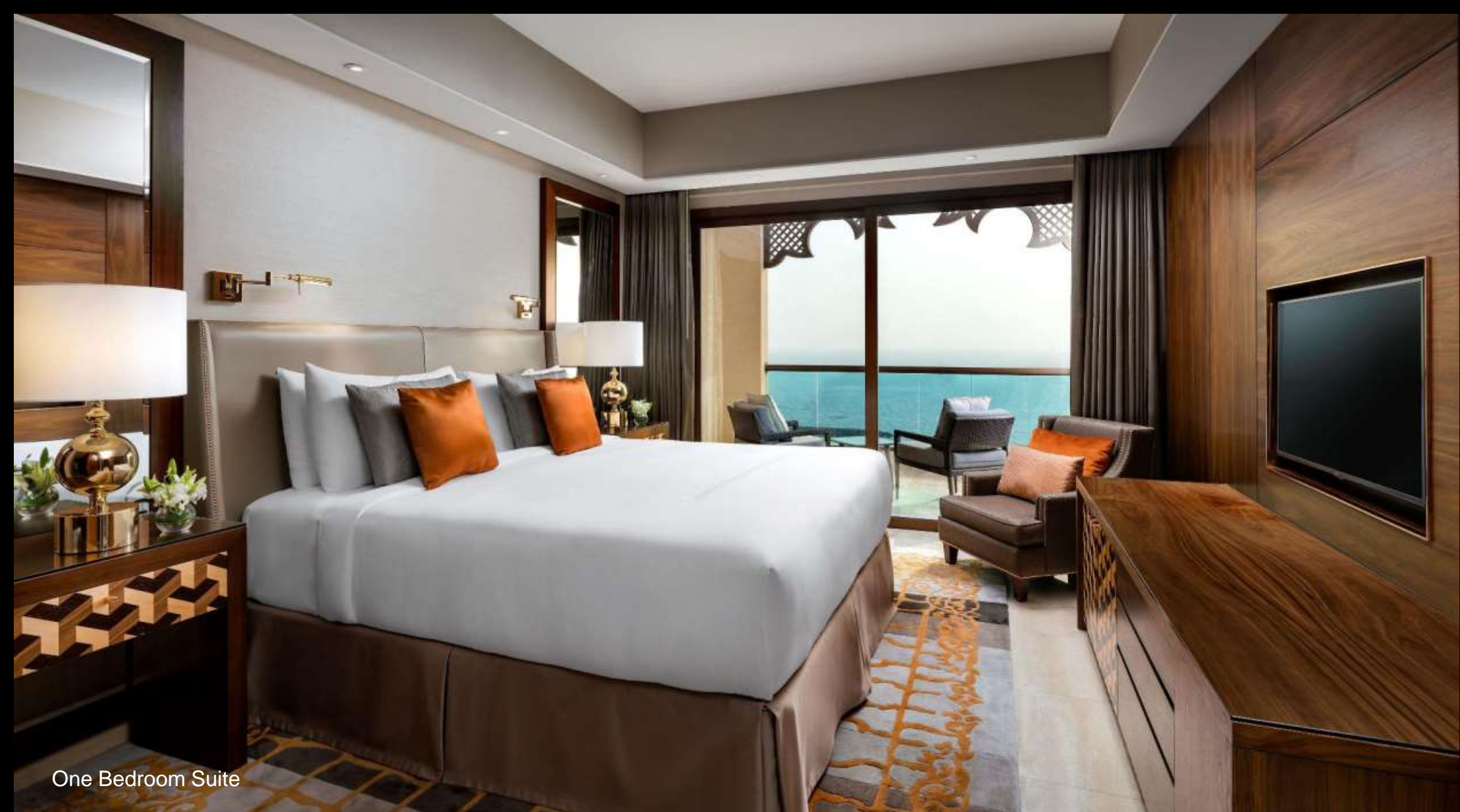
One Bedroom Suite