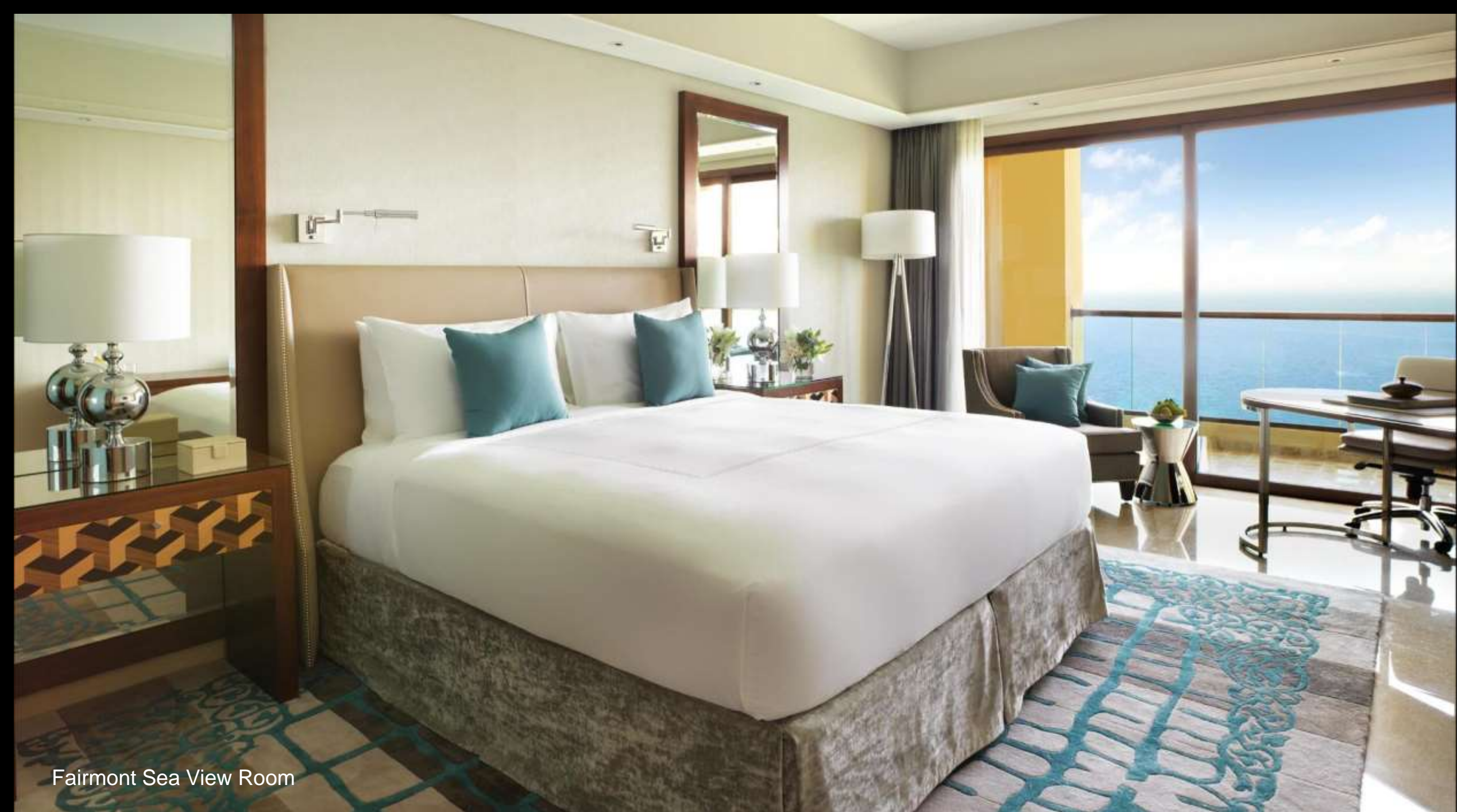
Fairmont Sea View Room