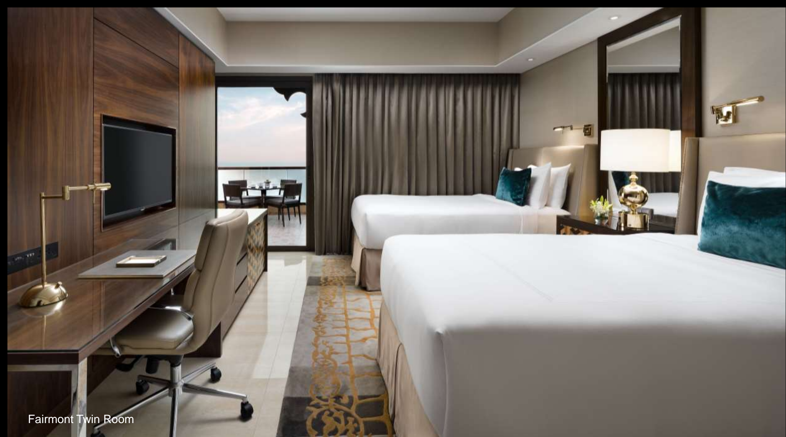
Fairmont Twin Room