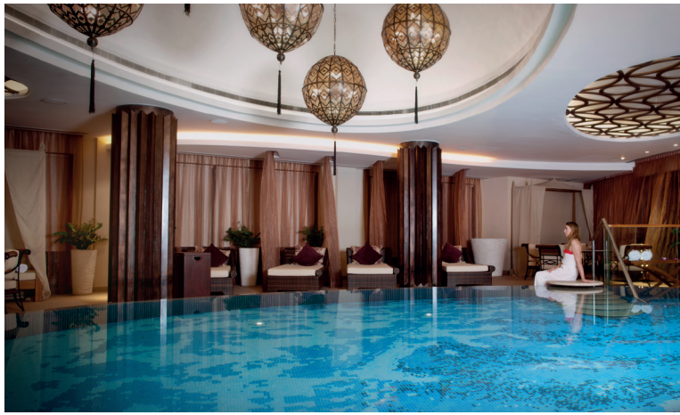
Thalassa Sea & Spa