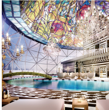
RISE (SKY BAR)

WWW.MONDRIAN-DOHA.COM +974 4045 5555 SALESDOHA@SBE.COM MONDRIANDOHA-RES@SBE.COM